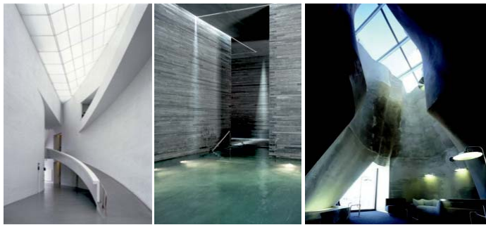
KIASMA Museum - Steven Holl

It is an idea that has been in the discipline from a long time but is surfacing literally in the practice recently. With architects like Steven Holl, Peter Zumthor \; who are influenced by literary works of theorists like Juhanni Pallasmaa; Phenomenology is opening a new door in Architecture. In the early 19 th cent; Philosopher Edmund Husserl introduced the term Phenomenology in the line of epistemology. Epistemology has been a point of contemplation since the time of Immanuel Kant; who's A Priori Knowledge set a path breaking understanding and evoked a continuing argument.